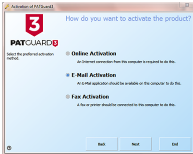
Activation Screen 2

3. Select E-Mail Activation or Fax Activation on the following screen and click next.