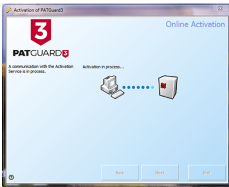
Activation Screen 4

6. The following screen will be displayed when Activation is completed successfully. Generally, you will not need to enter multiple Activation Keys. Click next or End to close the Activation Screen.