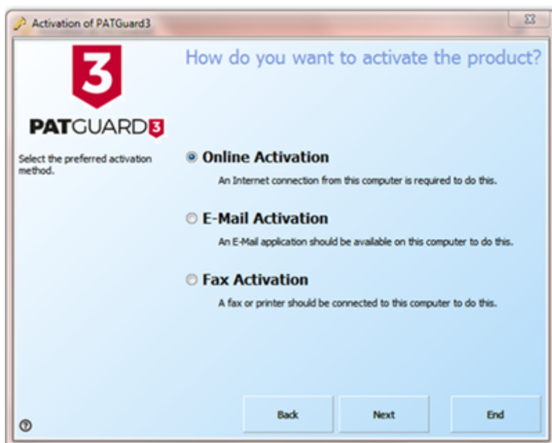
Activation Screen 1

2. Select Online Activation on the following screen and click next.