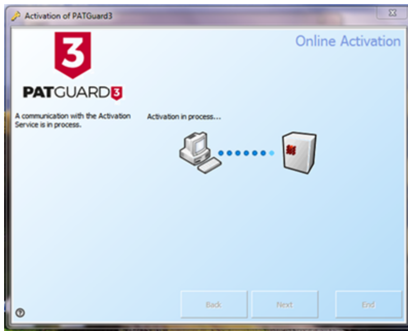
Activation Screen 4

6. The following screen will be displayed when Activation is completed successfully. Generally, you will not need to enter multiple Activation Keys. Click next or End to close the Activation Screen.