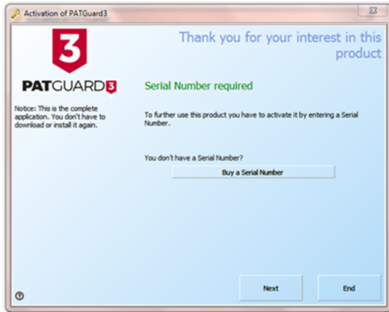
Activation Screen 1

3. Select E-Mail Activation or Fax Activation on the following screen and click next.