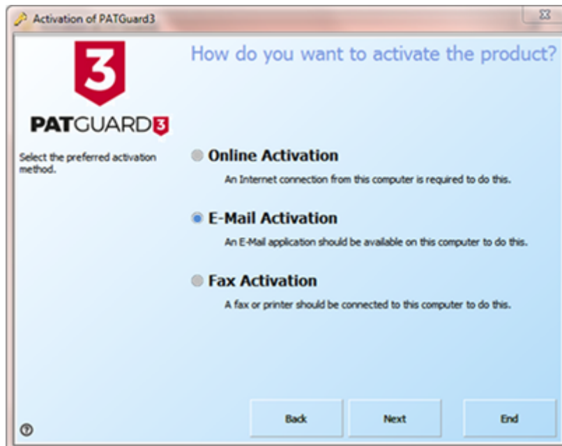
Activation Screen 2

3. Select E-Mail Activation or Fax Activation on the following screen and click next.