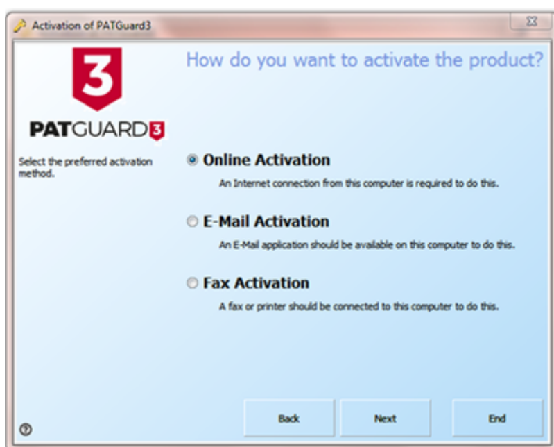
Activation Screen 1

2. Select Online Activation on the following screen and click next.