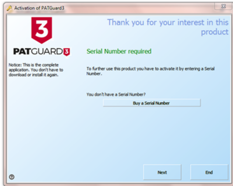
Activation Screen 1

3. Select E-Mail Activation or Fax Activation on the following screen and click next.