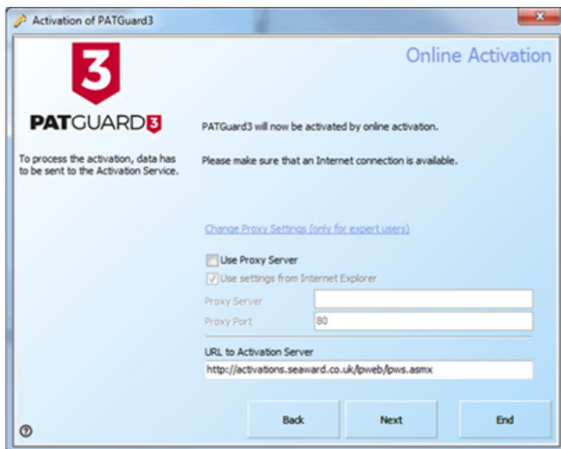
Proxy server details

for expert users). By default the Proxy Server settings will be the same as those set in Internet Explorer. To change the Proxy Server settings, select Use Proxy Server and enter the details in the Proxy Server and Proxy Port boxes.